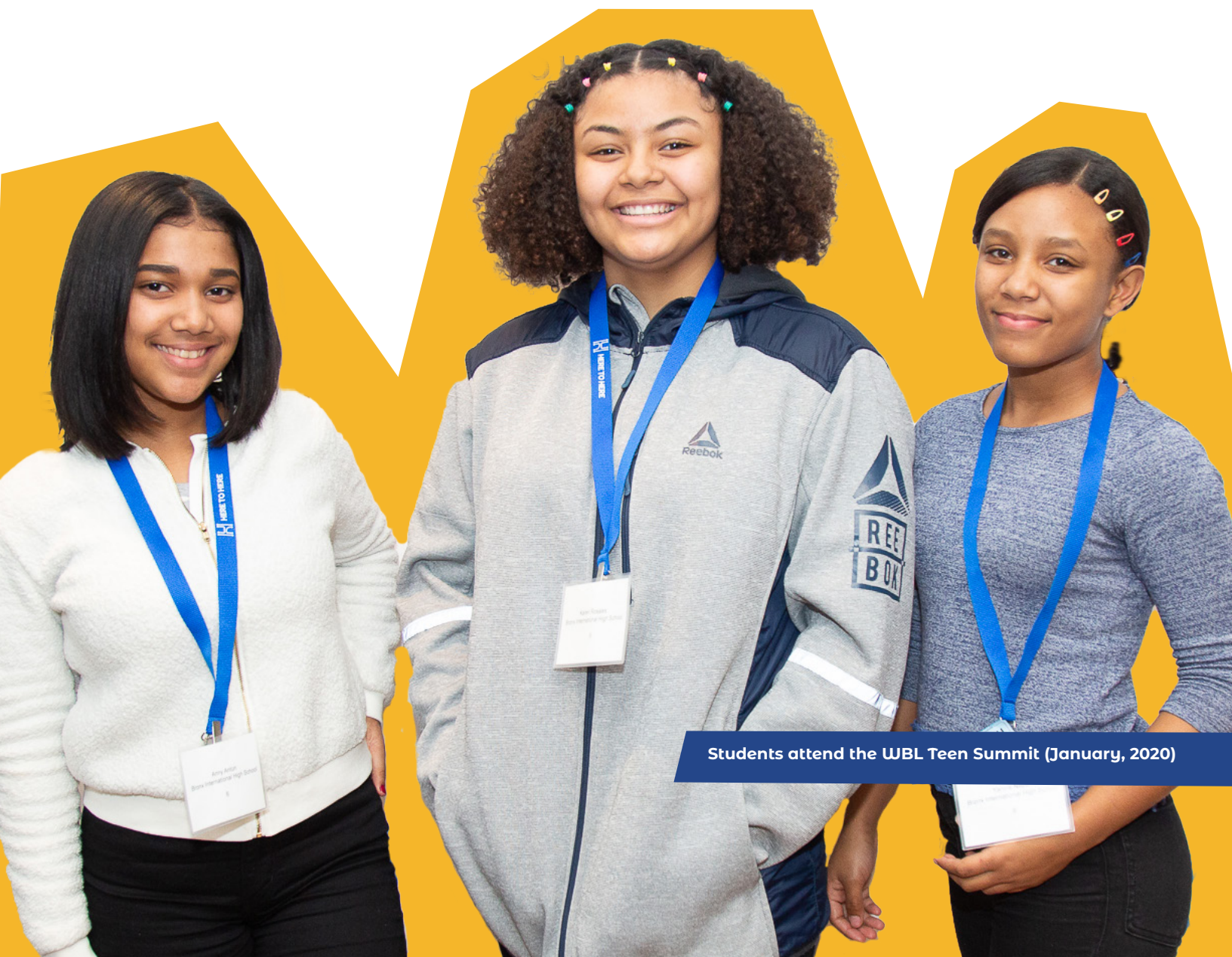
Students attend the WBL Teen Summit (January, 2020)

But above all, the H2H Student Ambassador model shows us what is possible when we dare believe in young people and invest not just in who they will become in the future but in who they are today.