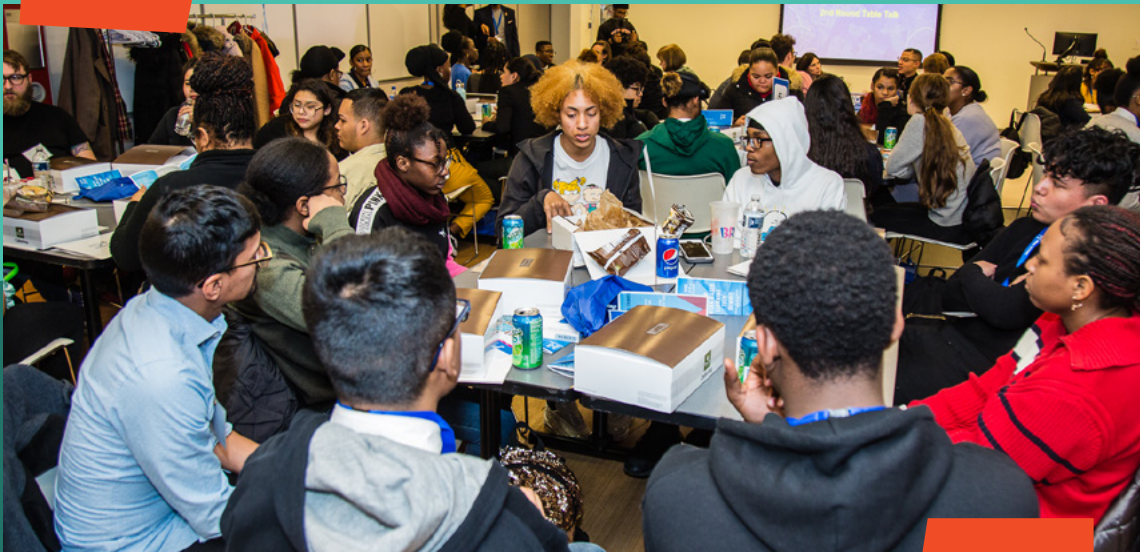
Students attend the WBL Teen Summit (January, 2020)

This case study, developed in partnership with the Equitable Futures Initiative, a project of the Bill & Melinda Gates Foundation, shares the experiences of H2H Student Ambassadors and the pivotal role they played in steering the H2H vision of creating equitable work-based learning opportunities for young people in the Bronx and throughout New York City. The case study showcases the initiative Student Ambassadors have taken to amplify and design professional development opportunities for themselves and their peers as well as their bold advocacy to increase investment in work-based learning programs.